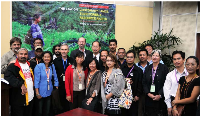
Orang Asal participants and some international speakers at the conference on Law on Customary Lands, Territories and Resource Rights: Bridging the Implementation Gap Conference.

As is the case in Australia, terminology to describe Indigenous peoples is a matter of debate. The term 'Orang Asli' has been used to refer to aboriginal peoples in Peninsular Malaysia, whereas the term 'Orang Asal' is used to refer collectively to the Indigenous peoples of Malaysia, including those who come from Borneo. Both Orang Asli and Orang Asal literally mean 'original people'. However the term Orang Asal is constantly under debate, as are alternative terms to further distinguish regional groupings.