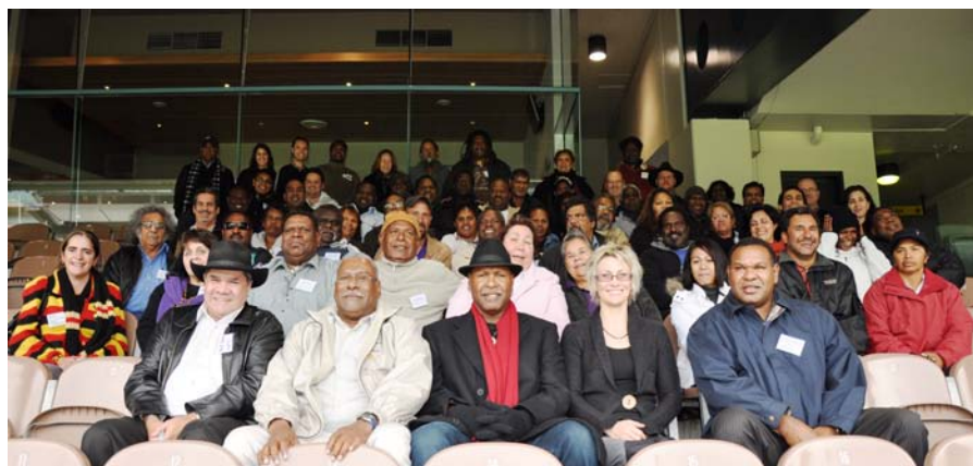
National Meeting of Registered Native Title Bodies Corporate, 2 June 2009, Melbourne.