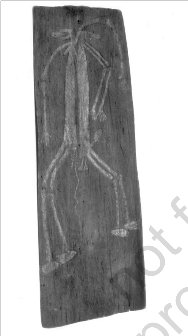
Figure 4 Bark-painting with two human-like figures, from the British Museum (Q73.Oc.17), possibly ex. Haslar Museum and dating to either pre-1865 or late 1870s

Taylor 1989, 1999). Port Essington is usually associated with the Garig language, although nineteenth-century Iwaidja vocabularies have also been collected from this area, suggesting close association. The Iwaidja artist whose work the Port Essington images most resemble is Paddy Compass Nambatbara (or 'Namadbara', c. 1898–1978). He was born only 20 years after many of the Port Essington barks were collected. On the other hand, the Port Essington barks differ in terms of certain style features, infill and subject matter