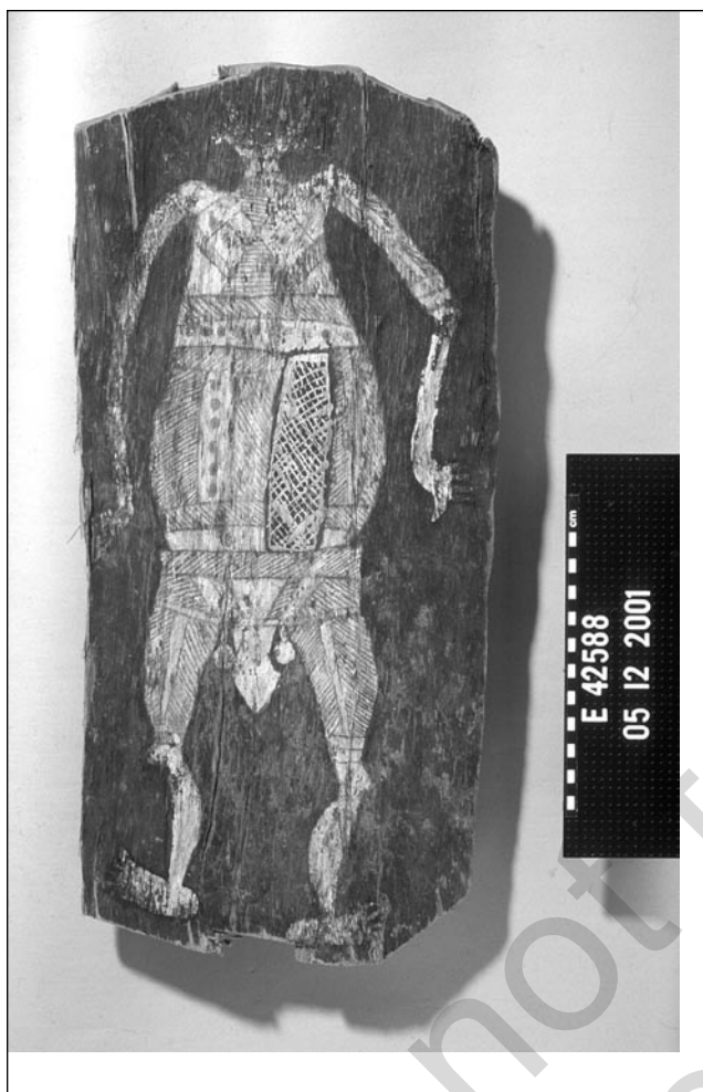
Figure 3 Large male figure in red-and-white, with genitalia prominently featured, donated to then National Museum of Victoria in 1922 by Dr George Horne, transferred to Australian Museum in 1936 (E42588). The bark is claimed to have been collected at Cape Don, to the west of Port Essington, and likely dates to late 1800s or early 1900s

late nineteenth-century labels. The second, with two human-like figures, has a handwritten label on the bark: 'M.704. From the Haslar Museum' (Figure 4). Further catalogue information indicates that the first was not registered until 1967 and that there is no information as to when it was collected. Whether the second actually is from the Haslar collection cannot be verified; the current catalogue information was not recorded until 1973.