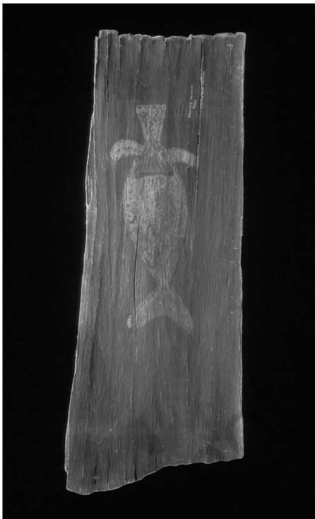
Figure 2 'Essington Island' bark-painting of a dugong, Cobourg Peninsula, Northern Territory, WJ Macleay Collection, Macleay Museum (P993), collected before August 1878; drawing from Cox (1878(3) plate 16, no. 18)

white. There is some cross-hatching and other line infill. The piece was purchased from Sandra Holmes in 1963 and attributed to Port Essington by Ed Ruhe in 1982. The second piece is both more spectacular and better documented. It consists of a large male figure in red-and-white, with genitalia prominently featured (Figure 3). In 1922, Dr George Horne donated the bark to the then National Museum of Victoria. It was transferred to the Australian Museum in 1936, joining a large collection of objects donated by Horne in 1926, shortly before his death (Anon. 1928:59). The bark is claimed to have been collected