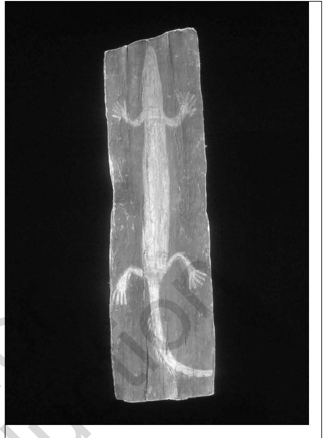
Figure 1 'Essington Island' bark-painting of a crocodile, Cobourg Peninsula, Northern Territory, WJ Macleay Collection, Macleay Museum (P992), collected before August 1878; drawing from Cox (1878(3) plate 16, no. 12)

Cox's comparison of the barks from 'Essington Island' with those 'of the Australian continent' in his introductory statement reinforces the view that the paintings came from an island off the north coast rather than the peninsula where Port Essington